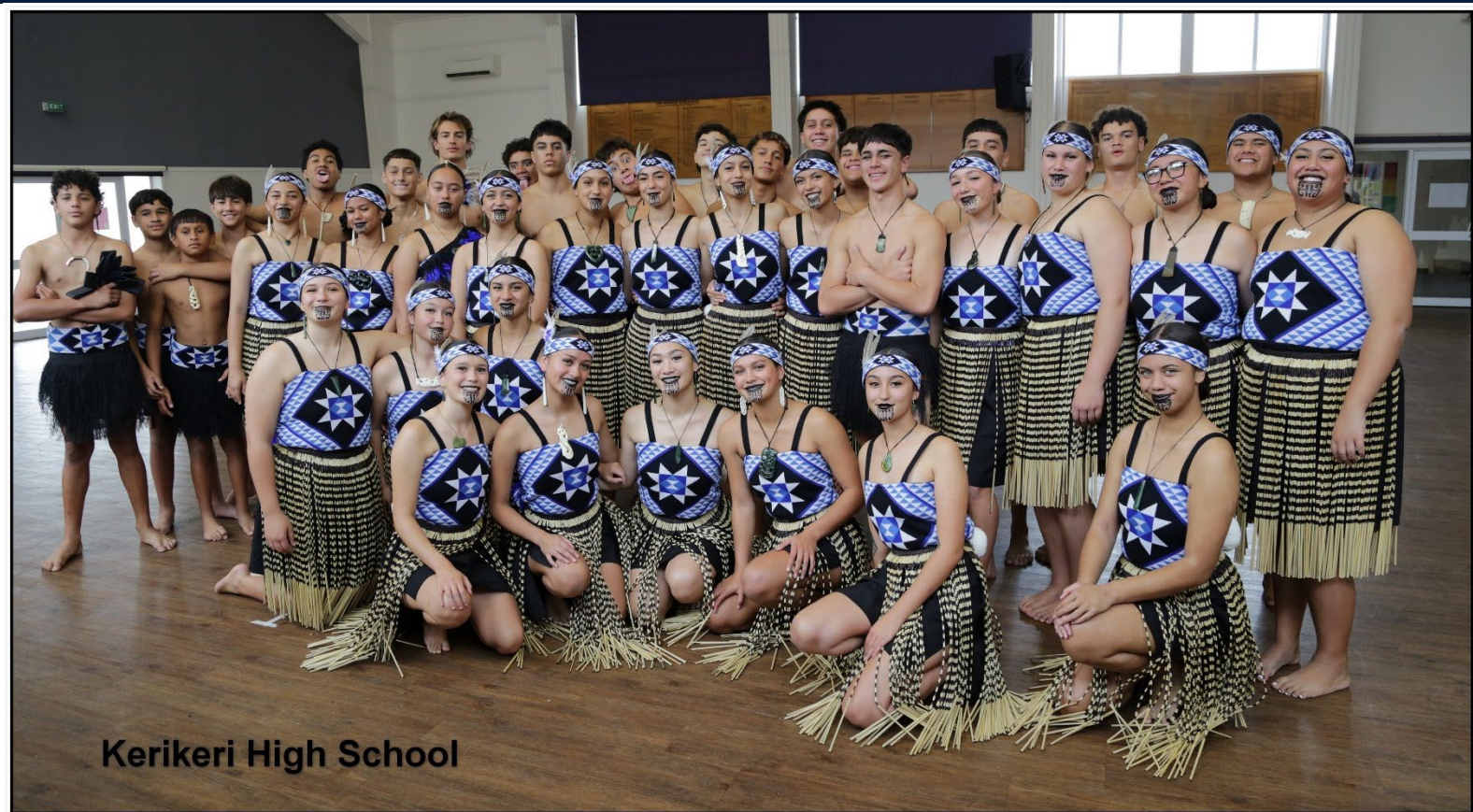
Kerikeri High School

Tū mai tōku maunga ko Pōkākā E rere atu nei te awa o Wairoa Riporipo tau ana ki te awa o ngā Rangatira Tiro kau atu ki te pā o Kororipo Raro nei i te mana o ngā tupuna Ko Hongi, ko Rewa, ko Tāreha Te marae ko Te Pou o Manakō Te kura ko Te Kerikeri Tihewa mauri ora